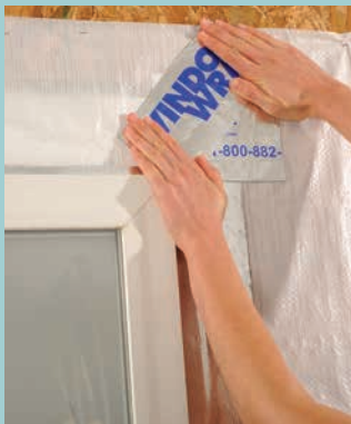
Fold house wrap back over header flange and secure with a piece of WindowWrap®. The self-sealing properties seal around nails, screws and fasteners.

Complete Step-by-Step Instructions can be found in our Resource Center at www.mfmbp.com .