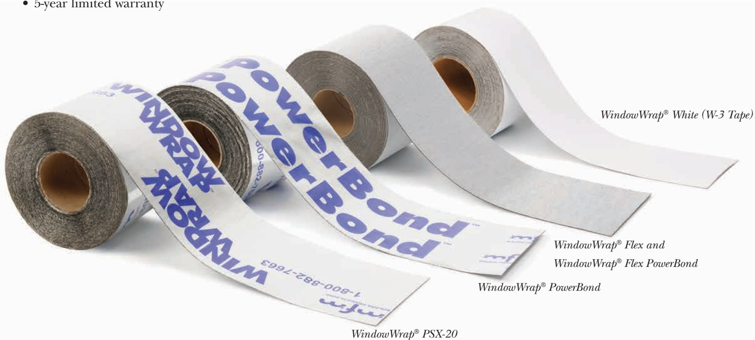
WindowWrap® White (W-3 Tape)

WindowWrap® products are suitable for new construction or home renovation projects. These professional grade products are proven performers and reduce expensive call backs.