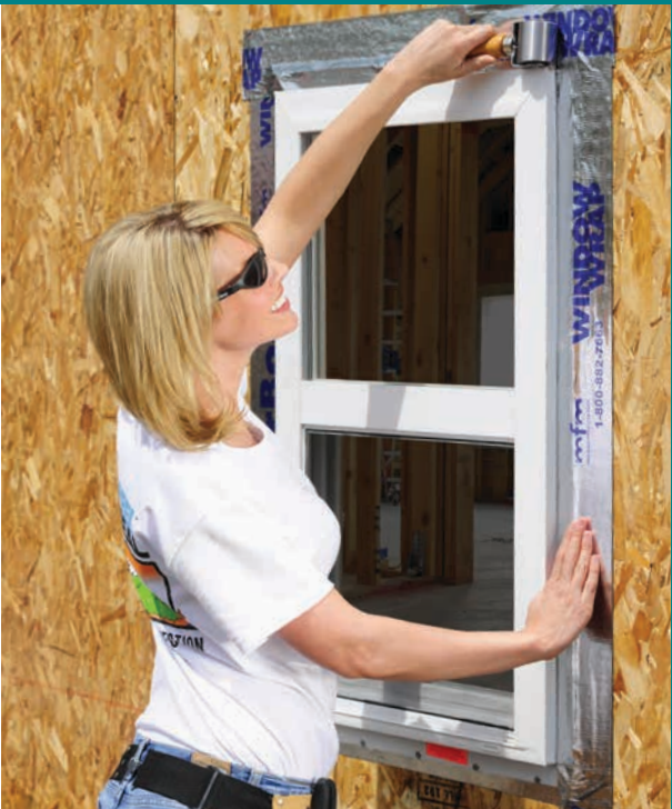
The WindowWrap® family of products are self-adhering, self-sealing waterproofing tapes designed for use around windows, doors, building seams and in general construction.